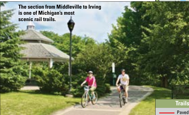
The section from Middleville to Irving is one of Michigan's most scenic rail trails.